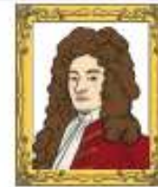
Sir Christopher Wren