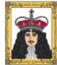
King Charles II