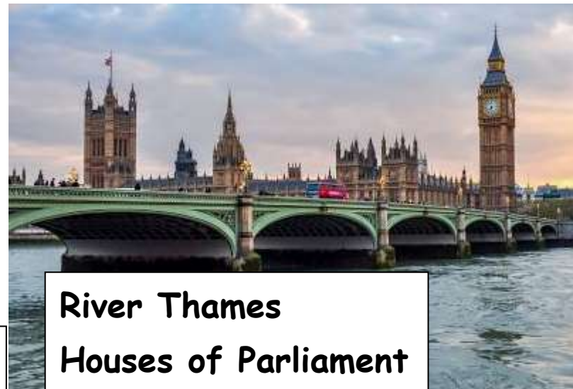
River Thames Houses of Parliament